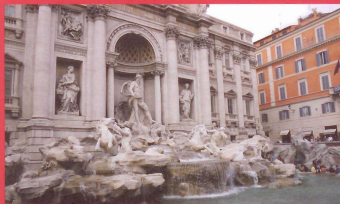
Trevi Fountain, Rome v